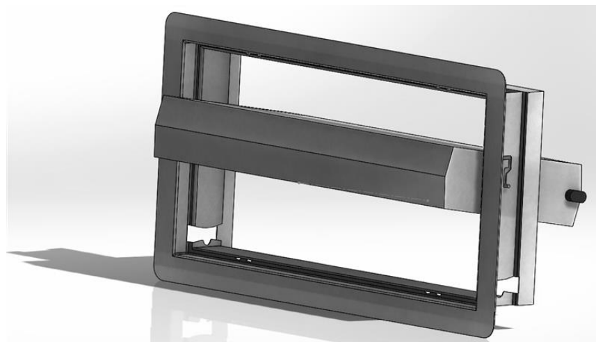
FIGURE 3—SMART VENT: SHOWN WITH FLOOD DOOR PIVOTED OPEN